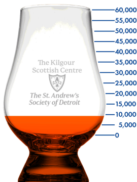
The Kilgour Centre Fund Drive