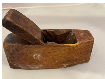
Hand Carved Tool

At the Kilgour center, The Charles Low Memorial Library has taken responsibility for collecting, cataloging, and preserving our remarkable artifacts collection. Many have been donated by St. Andrew's members and friends.