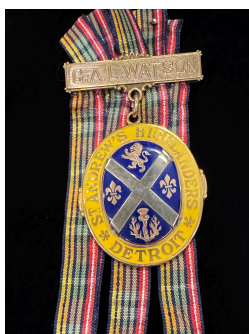
Antique Membership Pin