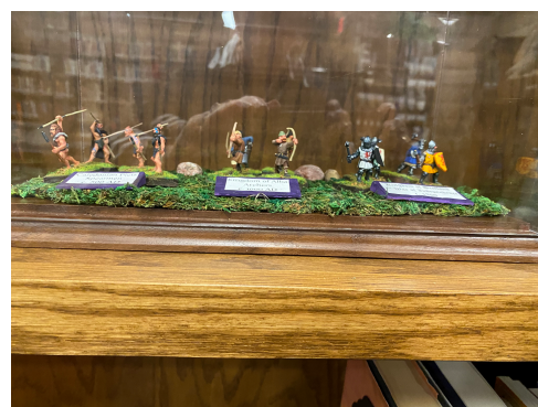
Scenario Depicting Caledonian Picts Spearmen c 500 AD Kingdom of Alba Archers c 1000 AD Kingdom of Scotland c 1300 AD

As artifacts are acquired, several steps are taken to insure safe keeping. The item is first numbered and entered into the Artifacts Database. A Title for the item (Membership Pin), Type of item (Antique Lapel Pin), and Description of the artifact (Blue and Yellow St. Andrew's oval pin affixed to three tartan ribbons clasped together with a gold bar containing the name of the member). The item is Labeled using the Database number and the prescribed method for that particular type of artifact. The artifact is then Photographed for insertion into the Database, and the location of the artifact is noted.