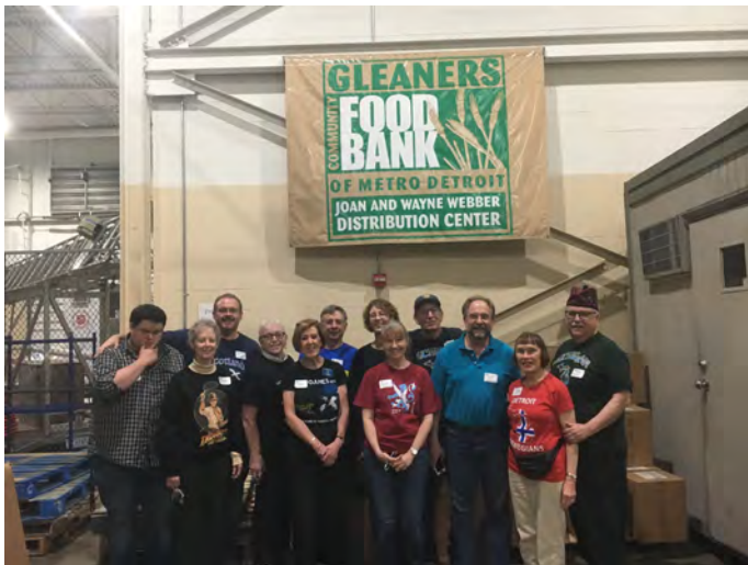
Our work crew at the Gleaners Challenge