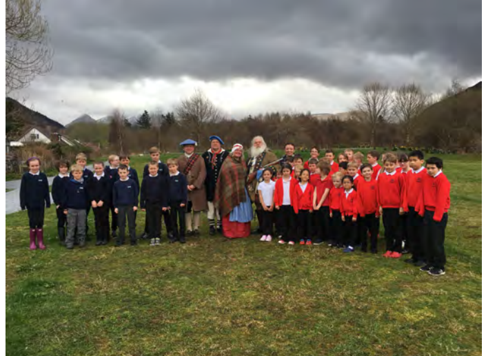
MacFarlane's Company working in Scotland. Thanks again to SASD for all your support.